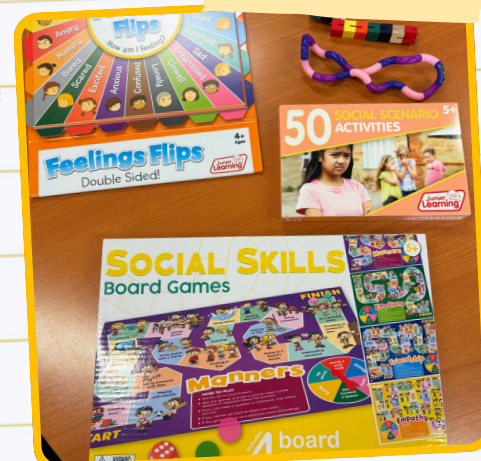
We always love building our collection of social and emotional skills resources!